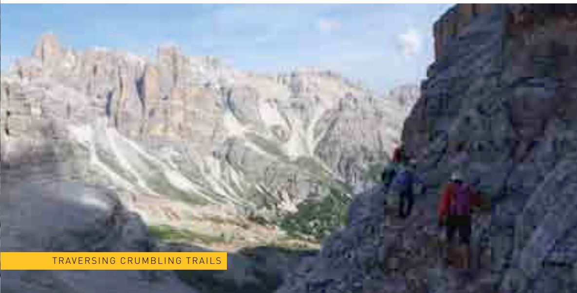
TRAVERSING CRUMBLING TRAILS