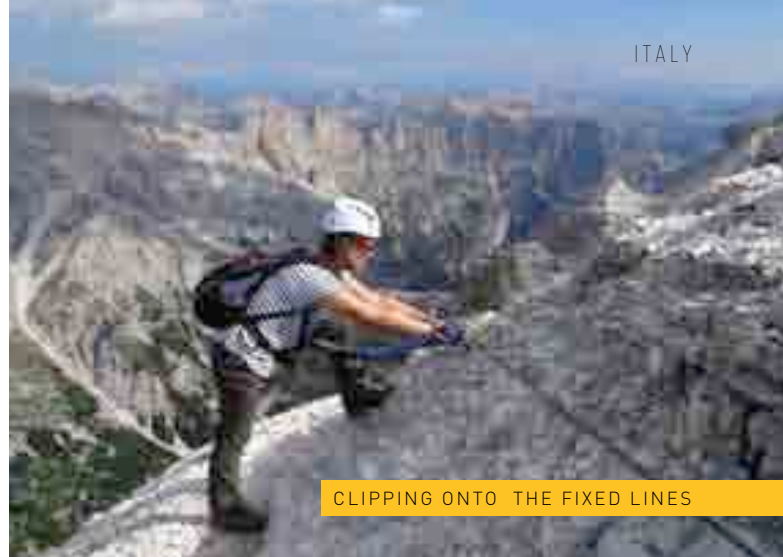
CLIPPING ONTO THE FIXED LINES