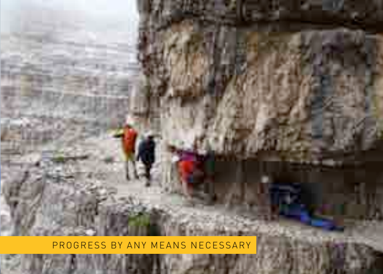
PROGRESS BY ANY MEANS NECESSARY