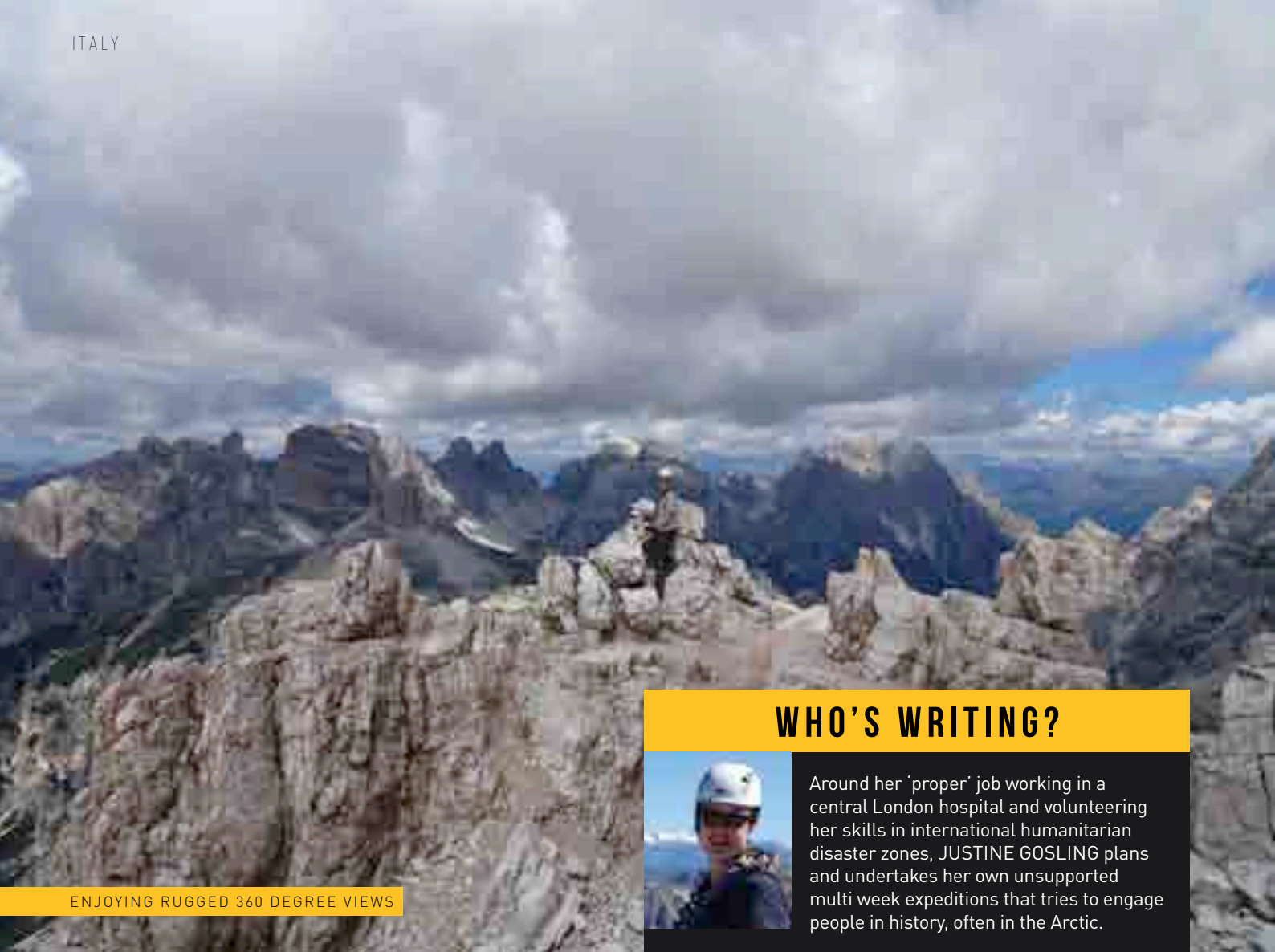
ENJOYING RUGGED 360 DEGREE VIEWS