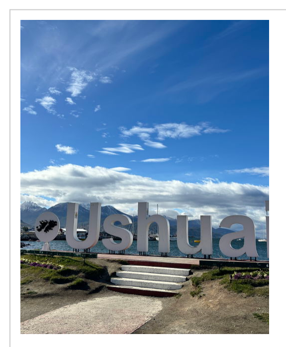
4 days from US$1,730 per person

When booking your holiday, you will be able to 'add an extension option'. Once we have received your booking we will contact you to discuss additional services required for the extension and to take any additional deposit.