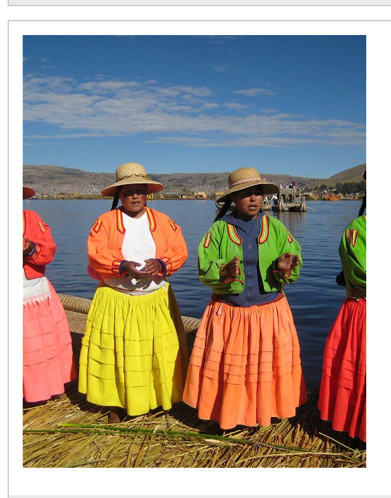
7 days from US$5,105 per person

Situated over 600 miles from the mainland of South America, the remote archipelago of the Galapagos Islands needs little introduction. The Galapagos Islands are considered to the crown jewels of the natural world, achieving near mythological status following visits by Charles Darwin. It was on his second visit aboard HMS Beagle in 1835 that Darwin's scientific studies introduced the world to the theory of evolution. The islands teem with life, much of which seem totally unphased and perhaps curious of visitors. Of the thirteen major islands, on five have any form of human habitation. The environmental footprint is kept to an absolute minimum, allowing you, the visitor, a chance to explore the incredible biodiversity of these famous islands untouched by human development. Expect close encounters with blue-footed boobies, frigate birds, albatross, giant tortoises, seals, turtles and dinasaur-like lizards amongst many, many other examples.